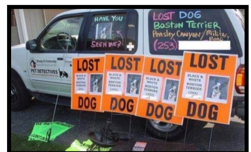
YOUR CAR IS A MOVING BILLBOARD