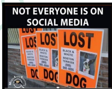
USE FOR INTERSECTIONS & YARDS

****KEEP A PICTURE OF YOUR FLYER ON YOUR PHONE, TO SHARE RIGHT AWAY WITH ANYONE. THEY CAN TAKE A PICTURE OR YOU CAN SEND IT TO THEM****